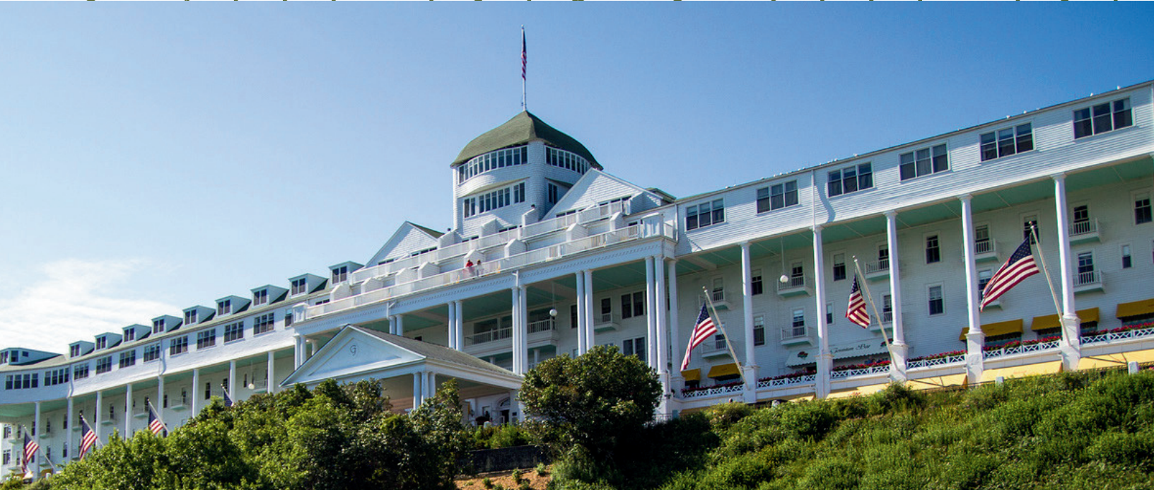
EXHIBIT & SPONSORSHIP OPPORTUNITIES

Engage and connect with 150+ family physicians at Michigan's largest CME conference planned by and for family physicians.