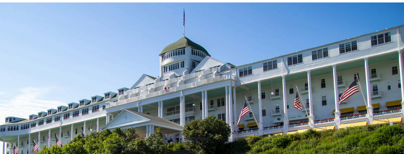
EXHIBIT & SPONSORSHIP OPPORTUNITIES

Engage and connect with 150+ family physicians at Michigan's largest CME conference planned by and for family physicians.